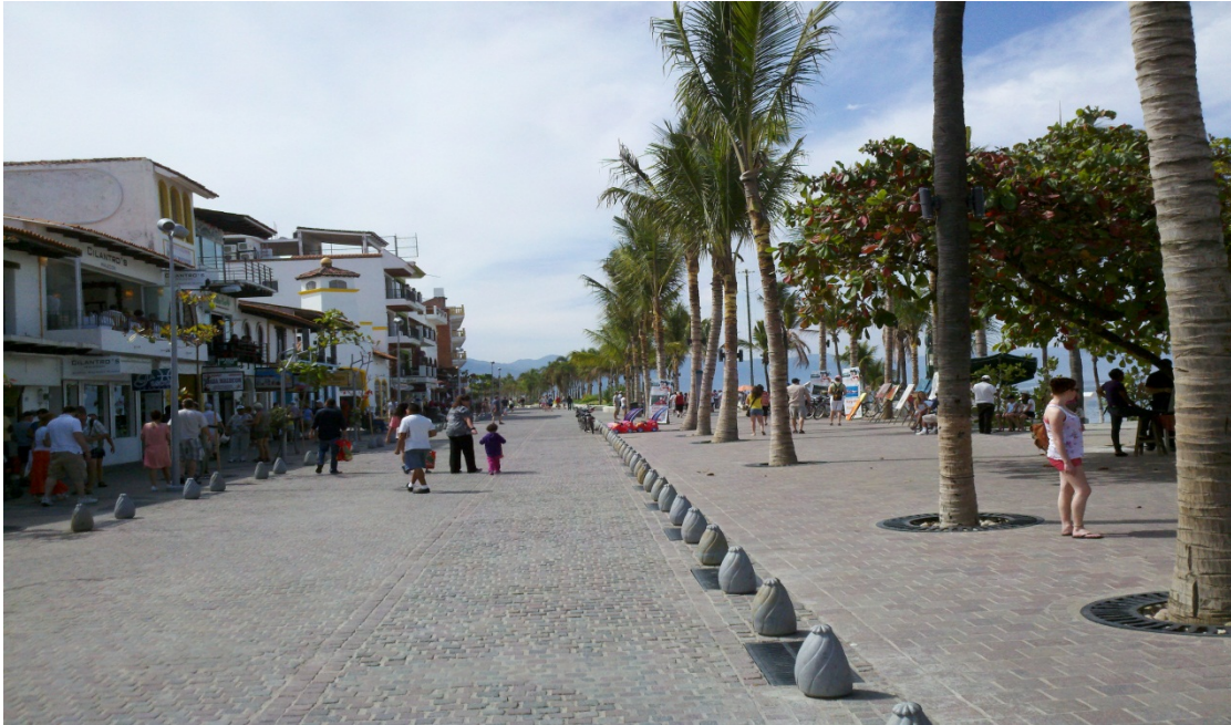
New Malecon (Boardwalk)

Nationally, Mexico continues to be a major producer of oil with new deep water wells in the Gulf of Mexico and limited exploration by foreign companies in other parts of the country. The recent rise in the price per barrel will benefit Mexico which already has substantial cash reserves that can be used for infrastructure development.